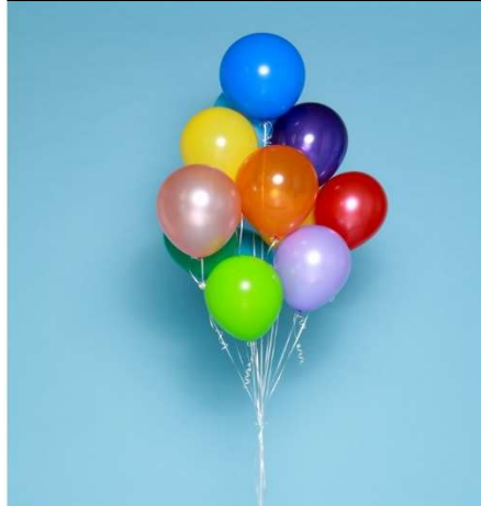
Colorful Balloon bouquet (8 pieces) 25€ Single item 3.50€