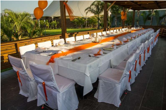
Boardroom Style up to 18 guests