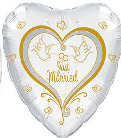
Just Married Micro Foil Balloons 25€