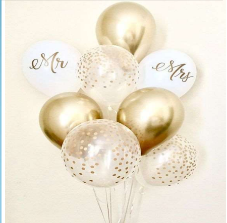
Perl Color Balloon bouquet (8 pieces) 28€ Single item 4€