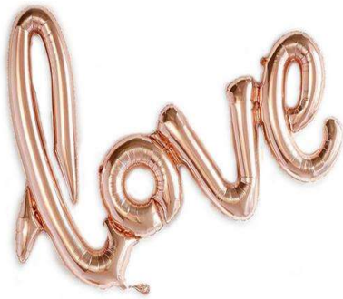
Love Foil Balloon 12€