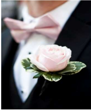
Buttonhole (single) 12€