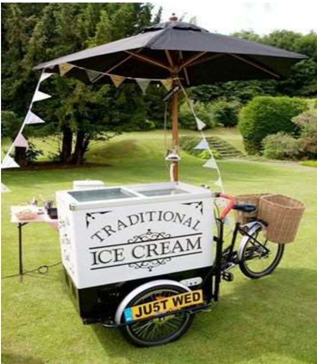
Ice Cream Cart for 50 people with 4 flavors 250€