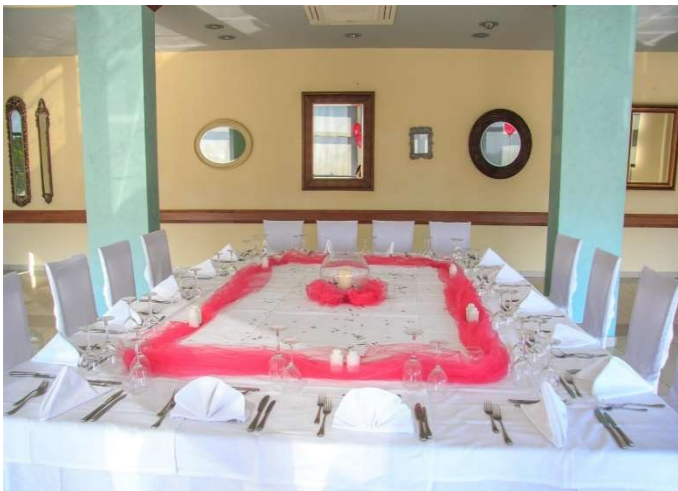
Hollow Square style up to 20 guests