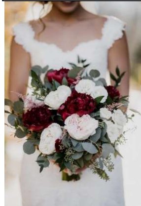
Upgraded Bridal Bouquet with green leaves 85€