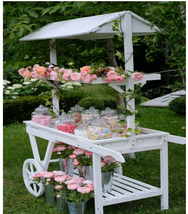
Candy Bar Cart for 50 people 250€