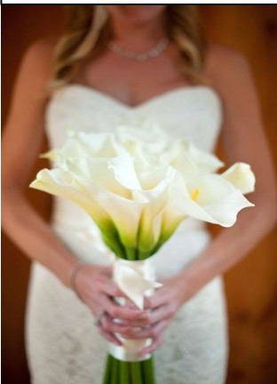
Upgraded Bridal Bouquet Calla – Lily 150€