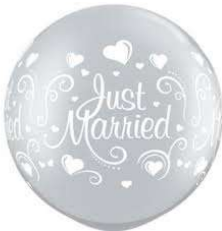
Round Big Balloon 3' 25€